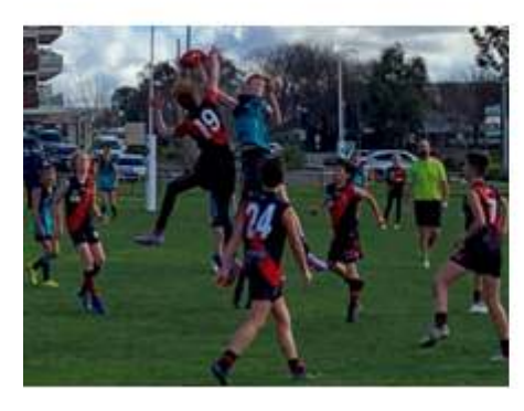
Are you sure these are U12's? Look at the height they get!