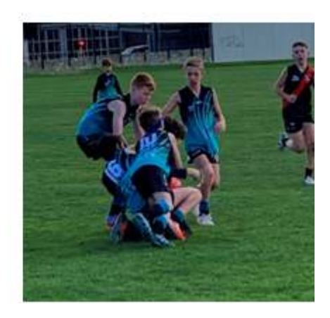
Who wants it more?