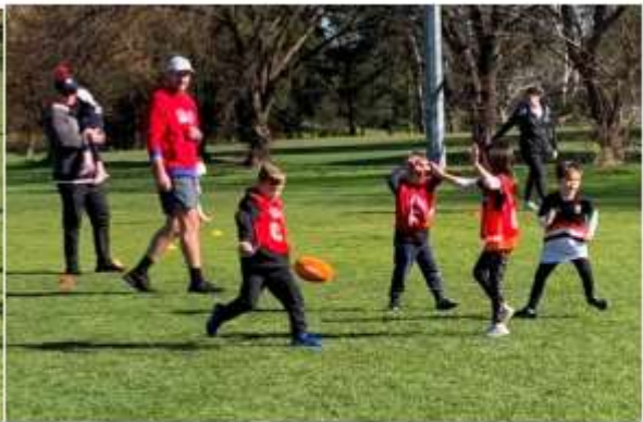
The start of a great passage of play!