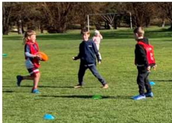
A budding Tony Lockett?