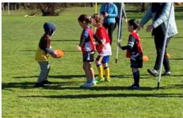
Move please so I can kick a goal?