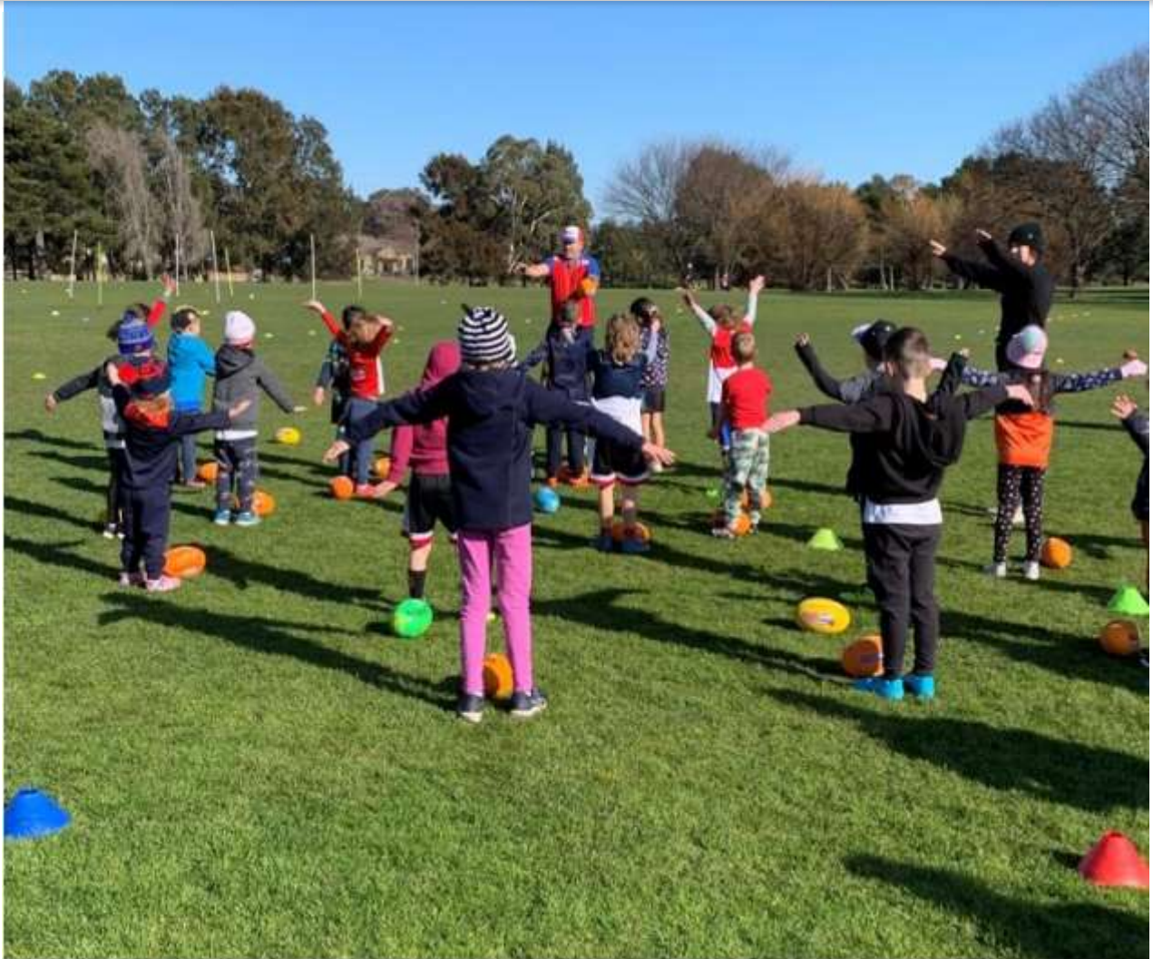
Always important to warm up!