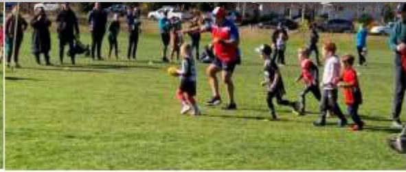
Go for goal!