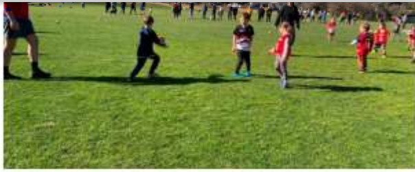
Kick it to me!